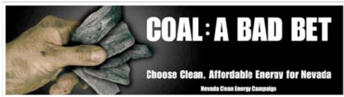
Billboard in Nevada

http://www.appvoices.org/index.php?/site/voice_stories/assessing_the_cost_of%20wise_county_coal_plant